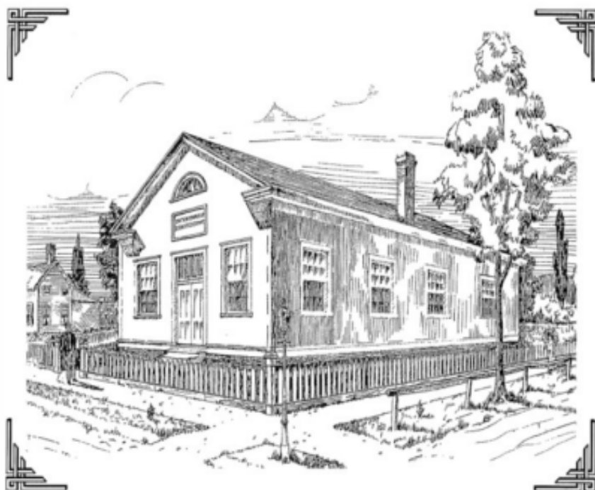
Our First Church Building 1862