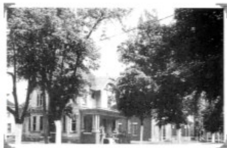
Our Second Parsonage 1884