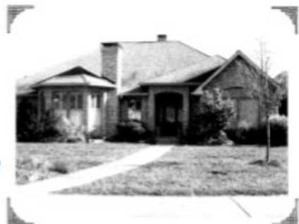
Our Current Parsonage 1998