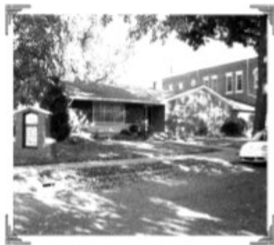
Our Third Parsonage 1959