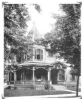
Our First Parsonage 1864