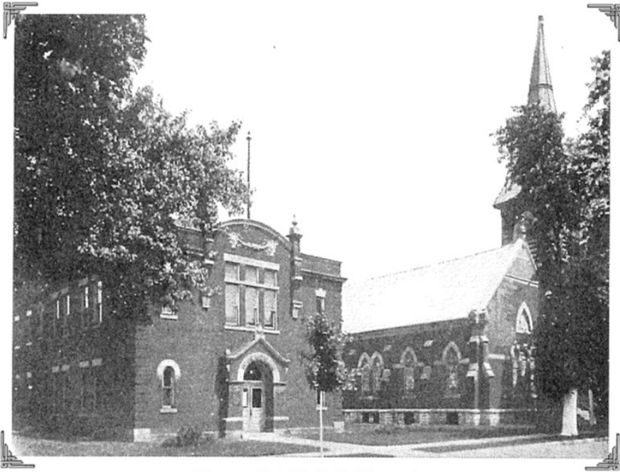
Memorial Hall Built in 1904