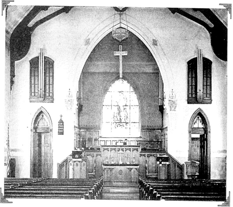
Church Remodel Project 1928