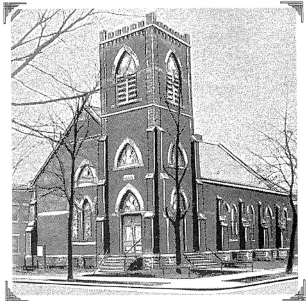
Steeple Removed 1935